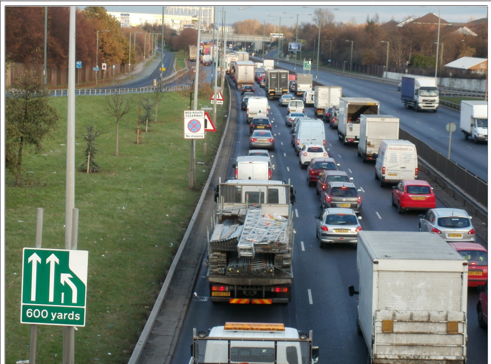
A view of the traffic jam from the Colney Hatch bridge.

The politicians dithered for years about providing funds for the road-widening. Over the years there have been many Ministers of Transport of different political parties, who as far as Friern Barnet residents were concerned were all useless. Houses along the North Circular were purchased, the occupants were moved on, the houses started to disintegrate. With a change of plan,