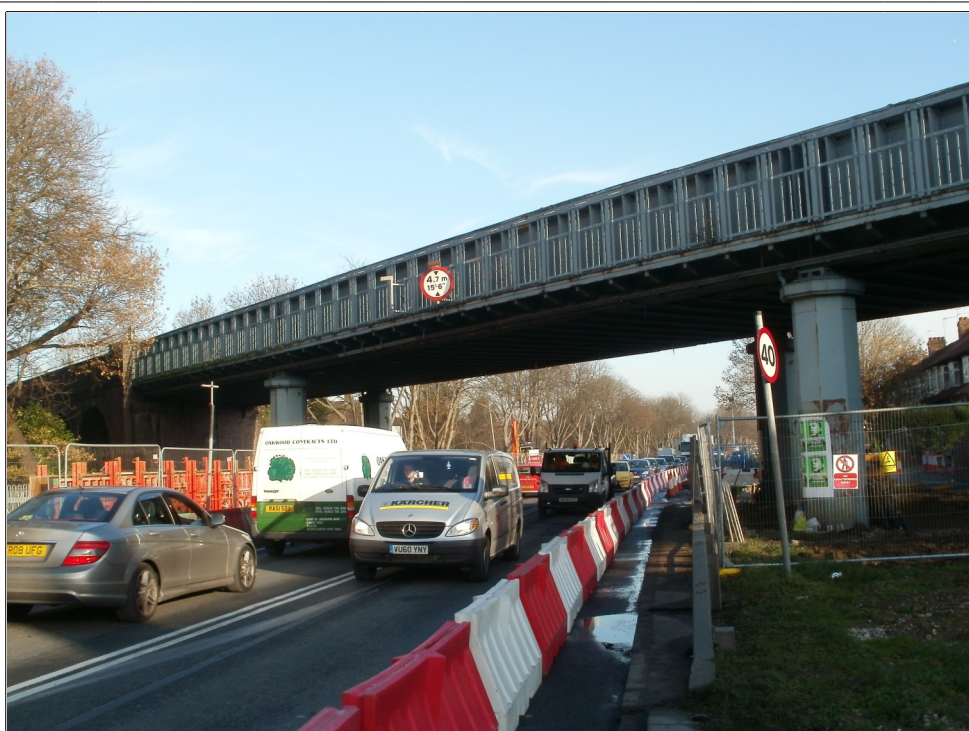
Telford Road, during the roadworks, traffic is reduced to one lane in each direction.

Thanks to the North Circular Road congestion, local residents are familiar with the gridlock around Tesco's car park when it is difficult to get in and impossible to get out.