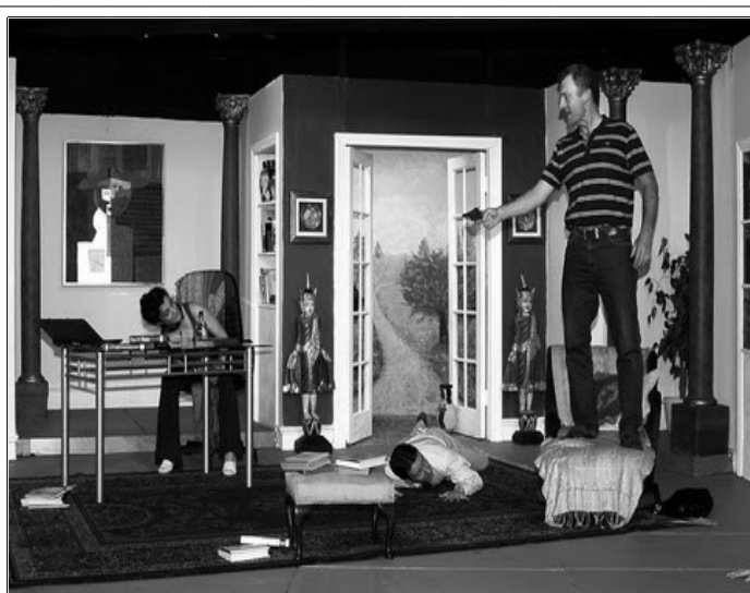
Scene from the Incognito's last production "Female of the Species"

The current re-building work will be completed on time and on budget at a cost of £135,000. As there was restricted access to the theatre building they couldn't bid for money from the disability funding bodies. The money had to