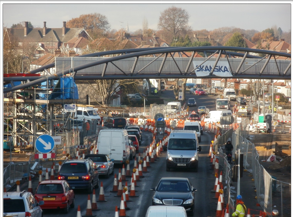
A new footbridge at the Telford Road, Bowes Road and Wilmer Way intersection.

regular drivers of the North Circular have learnt to get off the North Circular and head towards their destinations via Finchley High Road, Colney Hatch Lane and the narrow roads of Friern Barnet.