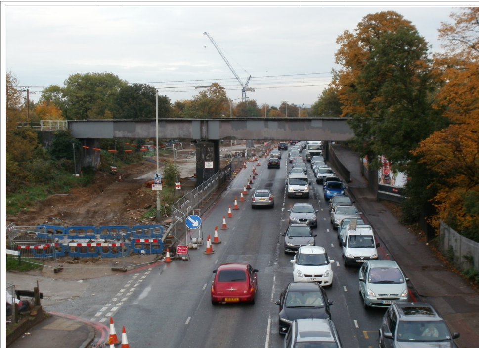
The bridge over Bowes Road carrying Hertford North section of the railway line.

There are three arches to the bridge, the central arch can take four lane of traffic, and the two outer arches could take at least one lane each. It is not clear, at the moment, how the bridge may be re-configured to take three lanes in each direction.