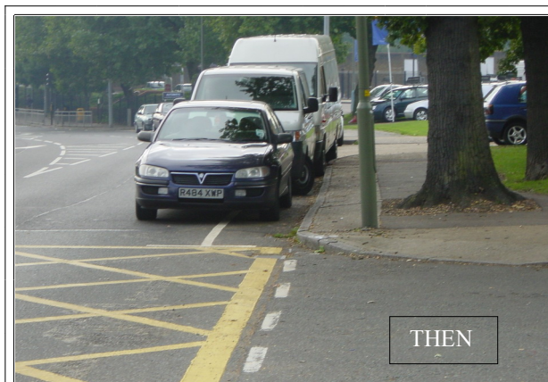
A couple of years ago the road leading into the Tesco entrance