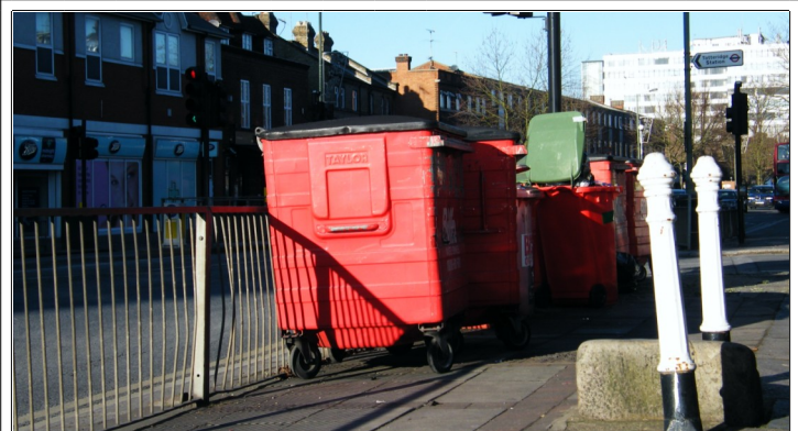
With one large bin parked in front of the "stone" there is insufficient

considering the implications of not making provision for the storage and disposal of waste then they will have to pay the consequences. If necessary they will have to put the waste in plastic bags and pay the council or a private contractor to collect the waste daily from their premises. There would be no need for the refuse to be left on the pavement except for a limited window of time to be advised by the council. In giving planning permission for eating and drinking establishments the Council should ensure there is proper provision for the removal of waste.