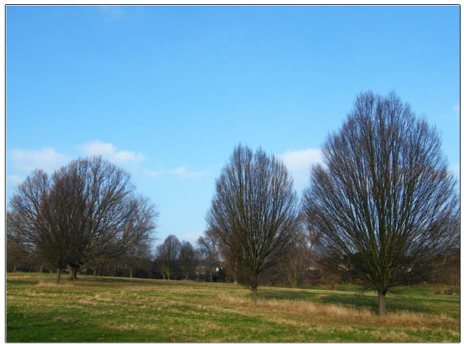
These pictures show some of the fine trees on the old Bethune Park golf course

On the whole Barnet Council's whizz-bang plan to rid itself of its golf courses has proved a bit of a damp squib.