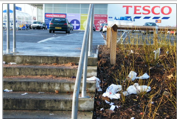
Plastic bags litter the car park