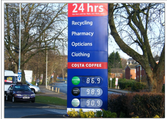
11 January 2009—Tesco Friern Barnet petrol prices