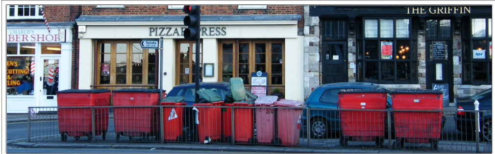
Pizza Express and the Griffin public house are attractive buildings spoilt by waste bins

The opinion of your Association is that Barnet Council should rigorously enforce its stated policy. If catering (or other) establishments have opened for business without