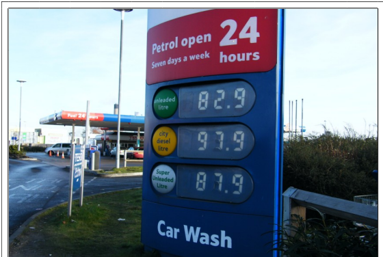
11 January 2009—Tesco Edmonton petrol prices