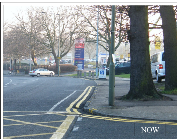
Today the road is clear between the entrance to Tesco and the box in front of the Ambulance station.

However, at a meeting with Deputy Leader Cllr Matthew Offord early in 2008, called "The Leader Listens", the problems were described once more. Cllr Offord promised to look into the matter and eventually, after more phone calls and e-mails, action was finally taken by the Council.