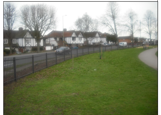
The photos show the trunks of the recently felled trees, and another view showing the bare nature of the boundary alongside Friern Barnet Lane due to lack of trees and bushes