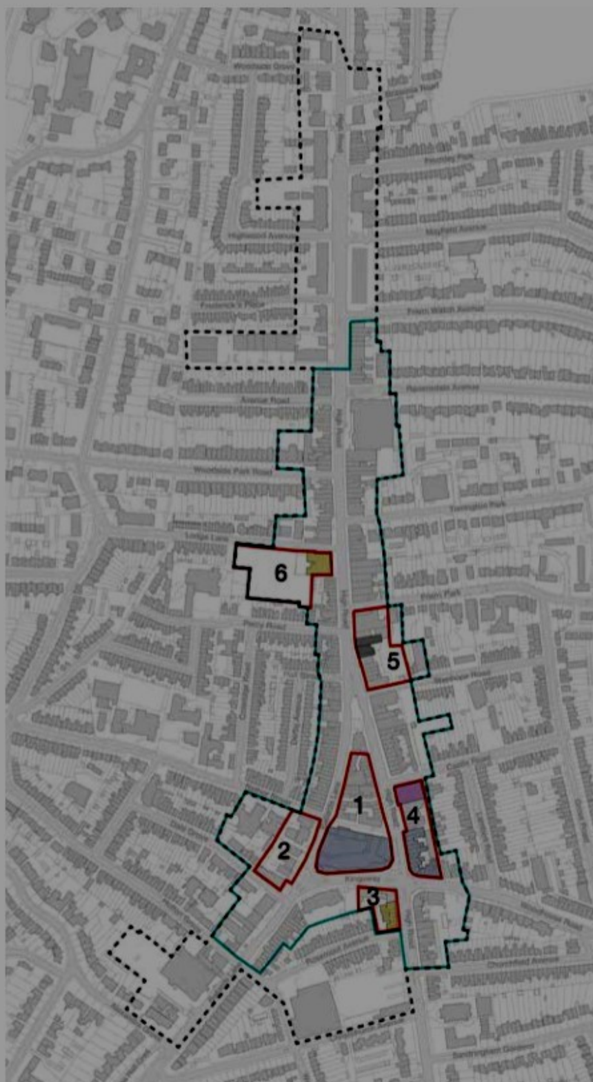
Figure 8: Key Opportunity Sites