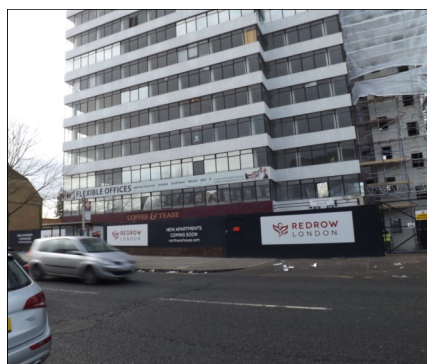
Well Grove /Chandos Avenue, Brethren site off Well Grove, Whetstone