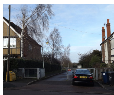
Former BP Garage (next to M&S Whetstone, 1412 High Road