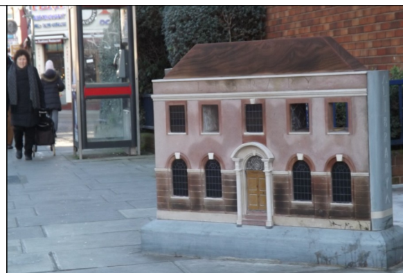
Near to Horace's set is the scale model of the North Finchley library. Hopefully both will remain as they are for many years to come.