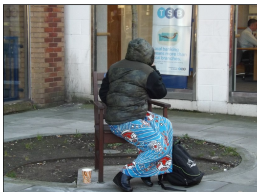
Young woman not wanting to have her picture taken sitting on "Horace's" seat. .