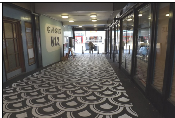
The "new" Grand Arcade has an elegant, grand new floor.