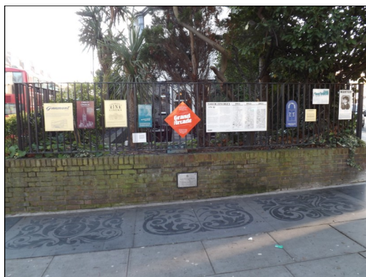
Array of plaques outside the Tally Ho pub. Note the decorated paving beneath the Council sign