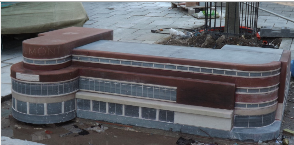
A scale model of the Gaumont cinema that used to occupy the site of the Tally Ho Tower. Older residents will remember the area as more spacious than now, with wide pavements and a triangle of grass in the Ballards Lane end and without high winds all year round.

On the railings outside the Tally Ho public